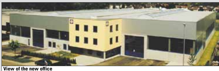
View of the new office

LORENZ | HURTH PFAUTER | KAPP KOEPPER | NILES LIEBHERR REISHAUER LINDNER KLINGELNBERG GLEASON VMMW