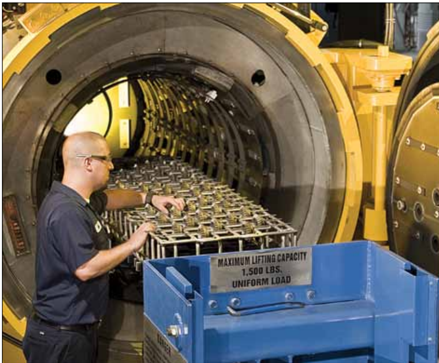
AISI 9310 bevel gear set up for low pressure vacuum carburizing (courtesy of Solar Atmospheres).

“Vacuum carburizing doesn’t emit any harmful gases, and most of the furnaces we install have a closed water system to cool the furnace, thus saving clean water,” St.