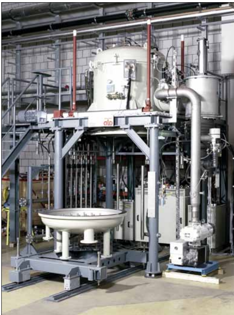
ALD-Holcroft furnaces are equipped with energy saving options to promote green manufacturing.

While challenges exist, major markets, including aerospace, automotive, agricultural, wind, mining and commercial